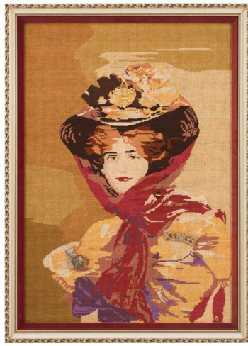
High Society (2013), mixed media, 30 x 21 3/4 inches

You fought yourself for anonymity Easy to kill it when you live at home with mother The generation gap – draw me a map