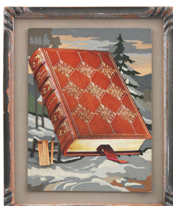
Adventures of Huckleberry Finn (2013), mixed media, 10 1/4 x 8 1/4 inches

Family values: easy to murder the other Anger walking back and forth in a Small train looks in, sees, pees