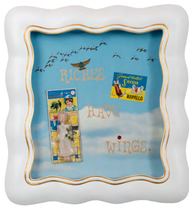
Riches Have Wings (2002), mixed media, 26 1/2 x 24 1/2 x 2 1/2 inches

Maybe, sucks in his lip, seer-up , paces Jester, we see each other across the threshold Maybe, rap but wind up black and blue ways