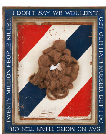
Strangelove (2004), mixed media, 30 1/8 x 24 1/4 x 3 1/8 inches

A Vermeer diptych that's split But did you also feel that way Say, couldn't it be an image war