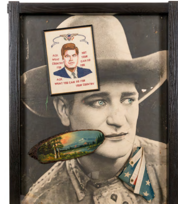
Lonesome Cowboy (2002), mixed media, 54 1/4 x 40 1/2 x 3 inches

Of moving back Down lover's lane Riches have wings