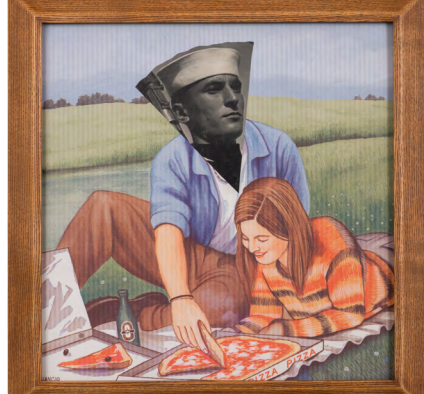
Slice of Life (2009), mixed media, 23 x 22 3/4 inches

Pathetic, just pathetic, to expect Strangers to know your name I guess Such is the price of fame