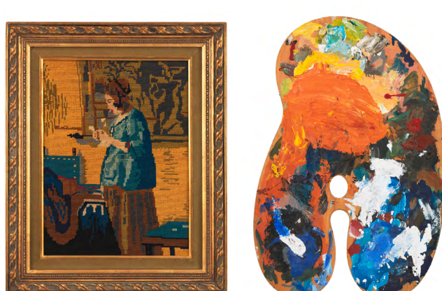
Vermeer Diptych (2013), mixed media, 21 1/2 x 17 1/4 x 15 inches

Lorraine, it's up to you Alexis Smith what's this Sad confluence of solitudes