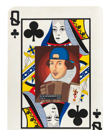
Jester (2013), mixed media, 25 x 18 inches

Lonesome cowboy You're a Kerouac haiku Just a slice of life but whose