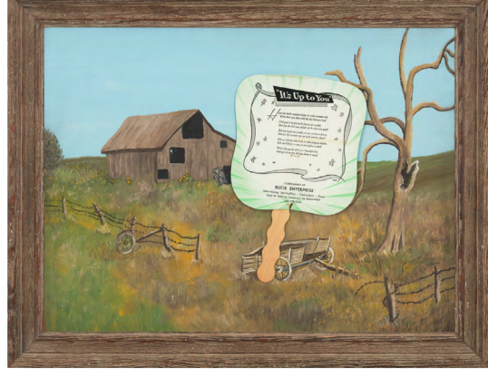
It's Up to You (2008), mixed media, 21 1/2 x 27 1/2 x 1 3/4 inches

On the occasion of viewing Alexis Smith at Garth Greenan Gallery (October 22–December 5, 2015).