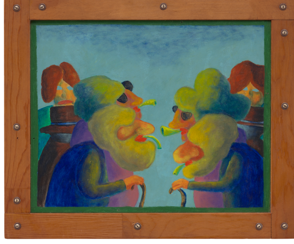
Acrylic on panel in artist’s frame, 13 1/8 x 15 3/4 inches.