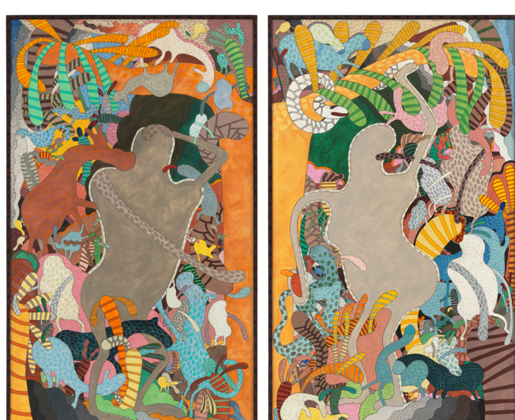
Acrylic on canvas in artist’s frame, two panels, each: 85 1/2 x 49 1/2 inches.

I like to present myself with different things to solve. You work over and over and over again on things that become your primary method. What each space requires is different, and I like to give myself a kind of pause to think about in any given work. If color becomes repetitious, then I make a point of having something slightly different in the next piece. It becomes interesting to me to shift relationships. ‘How far can I push this limited palette so that it still interests me?’ And, you know, I have to continue interesting myself.”