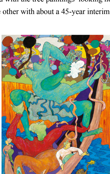
Acrylic on canvas, 60 x 36 inches.

As time has gone on, one is very familiar with how one draws things so that a lot of times the initial drawing might be different one from another, but there are relationships that do carry over. One work into the next. In the early-to-mid-’80s, I did a whole group of watercolors based on Botticelli’s ‘Birth of Venus,’ taking it through a variety of scenarios that would make no sense to Botticelli at all, but did to me: old Venus, wrinkled Venus, Venus on a bender. I had all kinds of different scenarios and ways of presenting that particular drawing. And with the tree paintings—looking up at the Marks diptych and then thinking about the Greenan diptych—one flowed into the other with about a 45-year interim.”