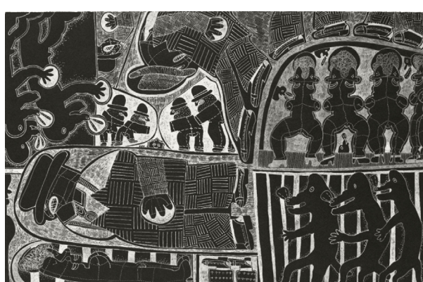
Ink on paper, 12 1/2 x 19 inches.

I don’t know which side is honking to get out of the way, but yeah, they’re not moving. They have reached a stalemate. ‘Honk’ is a lot more interesting than ‘Stalemate’ as a title. Although, ‘Stalemate’—I might write that down and ponder it.”