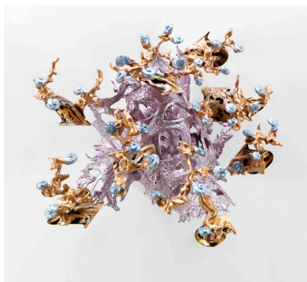
Rogue Bluffs (2010)