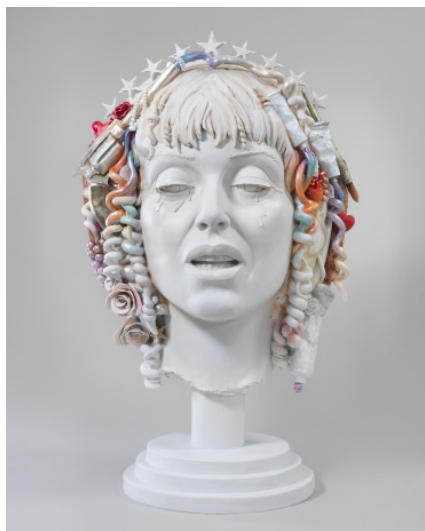
Self-Portrait as St. Teresa (2012)

The exhibition and its accompanying publication offer a retrospective view of Flack’s work since 1989. Best known as a Hyperrealist painter, Flack turned away from painting in 1985. Over the next four years, she produced a limited amount of work. Since then, however, she has created a remarkable body of sculpture focused on reimagining archetypal and mythical images of women. Works in the exhibition such as Medusa (1989) and Sofia (Vanitas) (1995) demonstrate Flack’s mastery of various time-honored sculptural traditions, as well as her deep emotional commitment to her subjects. Although steeped in history, her sculptures are undeniably contemporary. All incorporate overt references to popular culture—a plastic die, a giant revolver, or a tube of paint, for example. As a result, Flack’s “mystic archetypes” are instantly accessible to contemporary viewers.