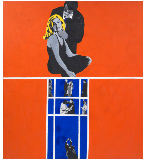
Rosalyn Drexler, Love and Violence (1965)

The exhibition defines Pop Abstraction as neither a style nor movement but, rather, a shared sensibility among generations of artists, beginning during the 1960s. Artists in the exhibition embrace the visual language of Pop—bold, processed color and graphic, cartoon-like iconography—without any nostalgia or consumer critique. Pop Abstraction revels in the inherently abstract nature of cartoons, comics, and advertising; however, its content remains personal and idiosyncratic. Whereas the artists in this exhibition have been aligned with various movements—Color Field, Pop, and Postminimalism, for example—they often stand on the periphery.