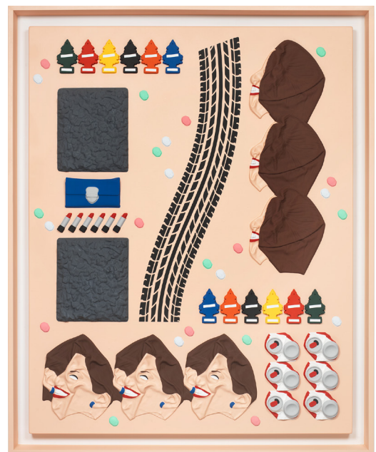
The Accident , 2014