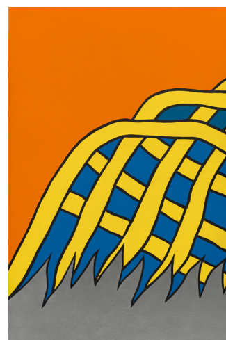
Quick Red Fox , 1963